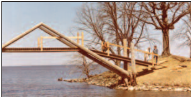
1973 Construction of Casey's Crossing, boat house seen below.