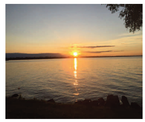
Sunset on Lake Winnebago