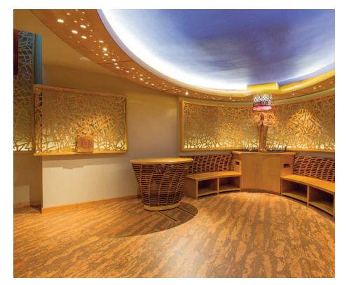
Chapel of the Annunciation