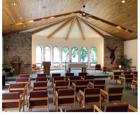
St. Ignatius of Loyola Chapel